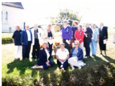
Left: Plaque that was dedicated on Sept 21, 2011. Right: Group photo of Sable River & Area WI with guests.