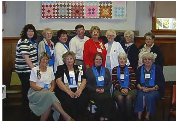
So many great memories. Maybe we can do this again sometime!