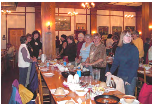
Mt. Vernon Dining Hall and Mill below.

The site of the WVCEOS Conference was Jackson's Mill, a conference facility near the town of Weston, WV. The facility is operated by the WV University Extension Service and is also the site of the State 4-H Camp.