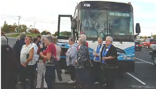
Travelers ready to board the bus.