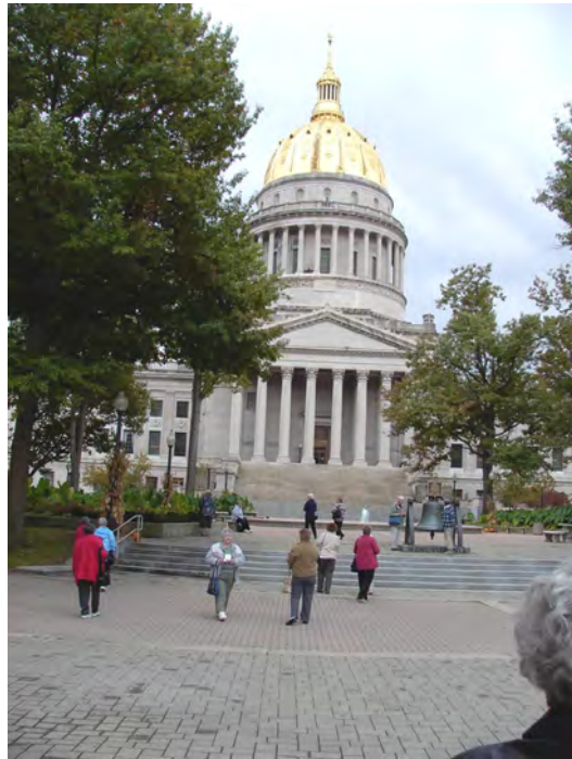
Delegates also had a chance to visit Charleston, the capitol city of West Virginia.