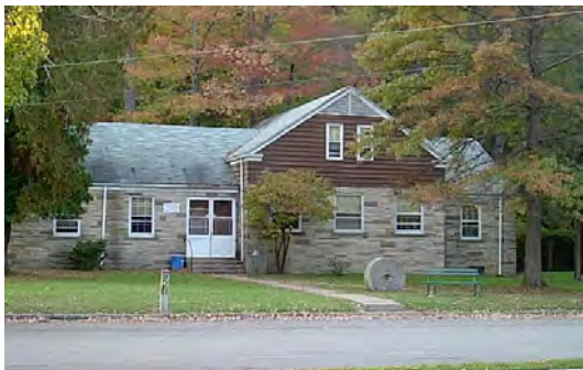
The Northern Panhandle Cabin where our travelers stayed during the Conference.